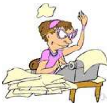
DeLuxe Writing Experts Services

Are you tired of needing to hire and pay several different individuals and/or companies for your business needs?